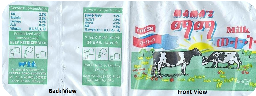
Figure 2. Mama Milk Packaging