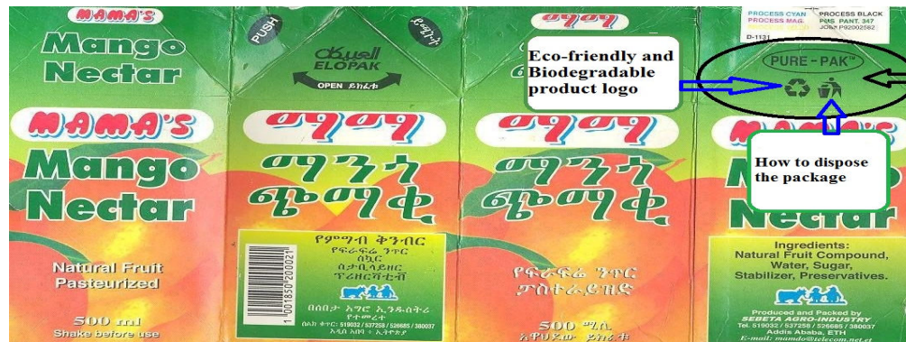
Figure 3. Mama Juice Packaging