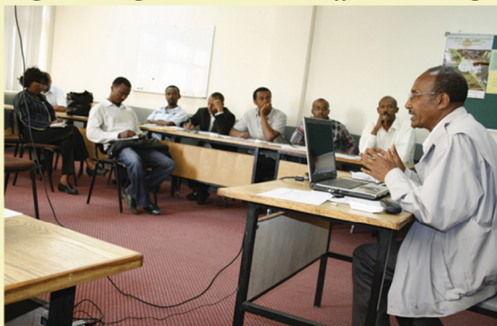
Regular Program Academic Staff on Training