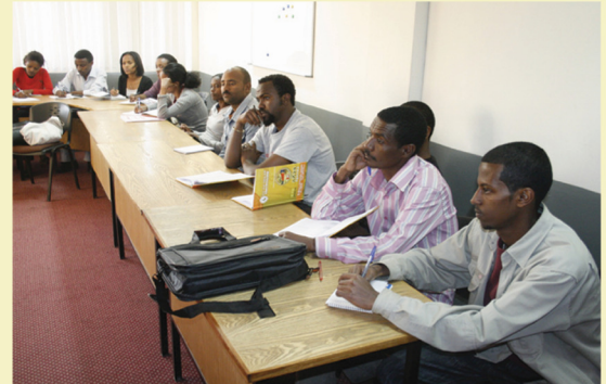
Training on Item Analysis, Testing Center staff