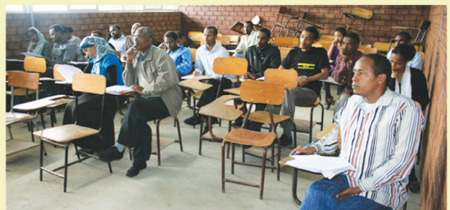
Testing Center Staff on Training