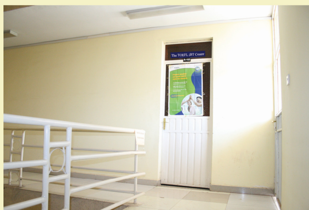
The TOEFL iBT Center

In addition, services such as tests for employment and placement are also provided to private and government organizations and ministries by the SMUC Testing Center. Results of tests outsourced to the Center are delivered to those who have made the commissions, in a matter of no more than three days after the administration of any particular test depending upon the number of candidates who have taken the test.