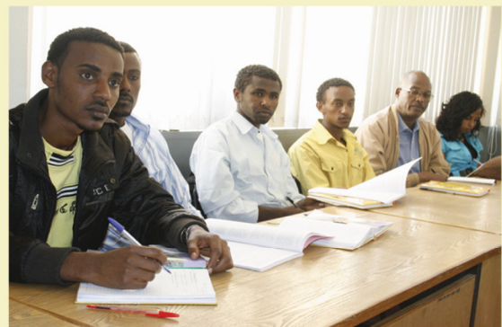
Training on Item Analysis, Testing Center staff