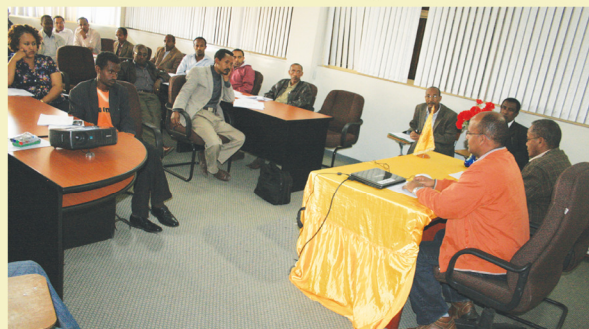
Staff Training on CoC-Style Testing