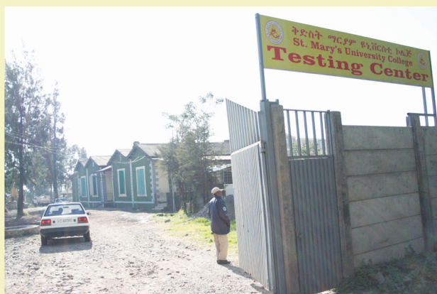
Testing Center, SMUC

The Testing Center is engaged in other types of assessment activities, too. Those are several. It is engaged in training SMUC academic staff – its own staff and instructors of the Regular Program – in test item and test blueprint preparation and item analysis. It also tries to buttress the efforts of the teaching staff of the UC in the deployment of TVET assessment schemes, so as to help ensure that they are in line with the purposes, aims and modalities of the nation-wide TVET Program. Indeed, the Testing Center helps train TVET instructors in assessment methods, and assists them to execute both the training they provide and their assessment work according to the stipulations of the national TVET Program.