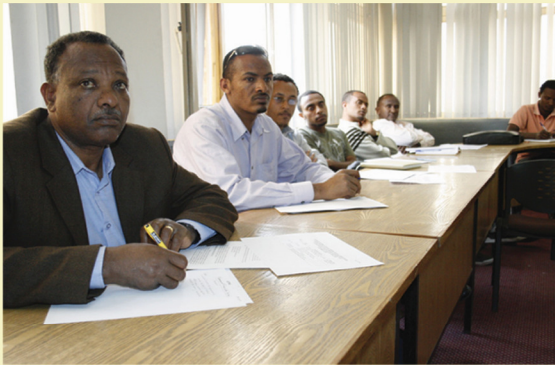
Regular Program Academic Staff on Training

Center’s assessors. The training was given to 23 assessors. It was conducted, so as to enable assessors perform proper item analysis on term-end exams conducted by the College of Open and Distance Learning of SMUC. The participants considered the training of great practical value. For the Testing Center, item analysis of exams is a stepping-stone to the creation of its digitized test item bank, planned to be effected in the near future.