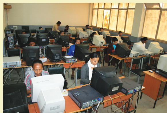
Graduates Taking CoC-Style Test