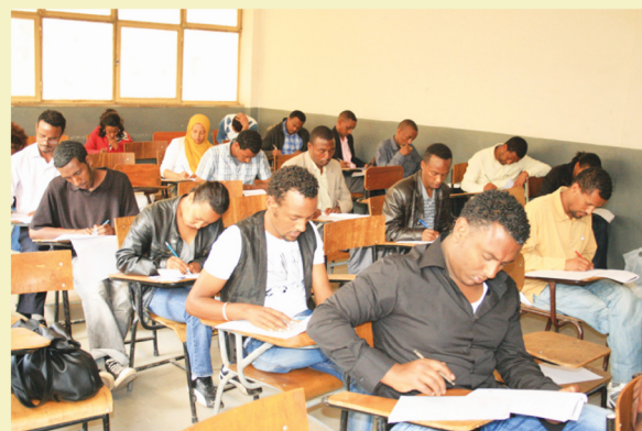
Graduates Taking CoC-Style Test