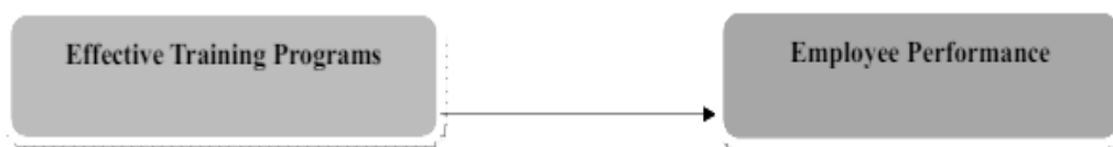
Figure 2.9.2 Theoretical Model Representing Relationship between Independent (Effective training Program) and Dependent Variable (Employee Performance)

Hence on the basis of the above review of literature, following proposition could be drawn: Those employees who receive effective training sessions are more able to perform well on the job by increasing the quality of work, hence achieving organizational goals and gaining competitive advantage.