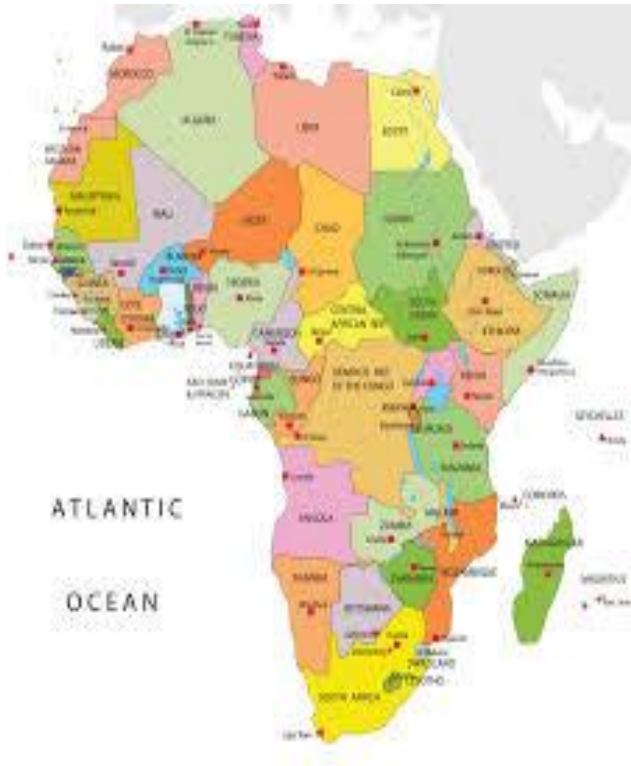
Map of Africa